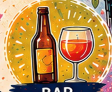
BAR FOR PARENTS

LIVE PERFORMANCES FROM THE CHOIR, SOLOISTS & PAST STUDENTS!