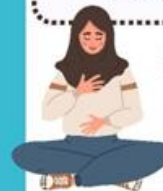
5 Finger Breathing

But here's something amazing: breathing slowly and deeply is like a secret superpower! Next time your child is feeling anxious, try to help them breathe in through their nose, and out through their mouth whilst tracing your hand.